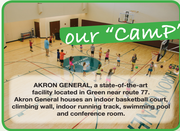
AKRON GENERAL , a state-of-the-art facility located in Green near route 77. Akron General houses an indoor basketball court, climbing wall, indoor running track, swimming pool and conference room.